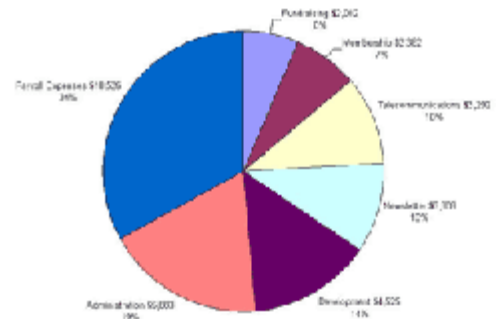
Northwest Dharma Association Expenses, 2008

2008 saw the completion of a year's cycle of producing the news electronically, thus reducing the expenditure represented by the print news in both labor and production costs, as well as lowering our carbon footprint. We added an easy-to-use method for turning the eNews into a printable pdf file.