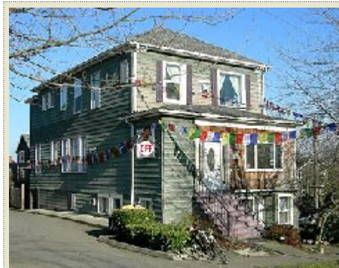
Found! A new location in Seattle's Central District for the Dharma Friendship Foundation. (Click on the photo above to view the image gallery)