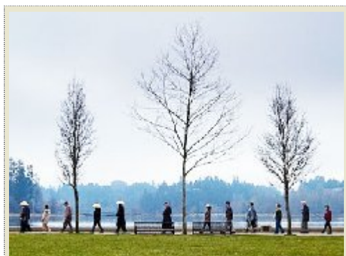
In the tradition of Thich Nhat Hanh, the "Walk for Peace" is practiced as a form of silent meditation.

Fundamental to the spirit of this walk is that it is only for the promotion of peace without political references or negative connotations. Participants were encouraged to positively generate goodwill in their hearts and wish the same for others. The hour-long walk ended with a group discussion and the promise to continue the event as an annual tradition.